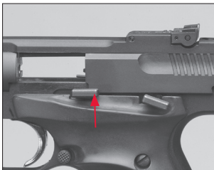
The slide release/stop latch is automatically actuated after the last cartridge is fired.