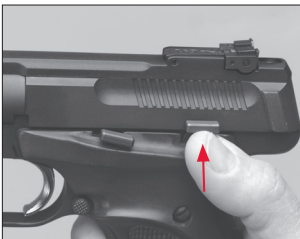
Engaging the manual thumb “safety.”