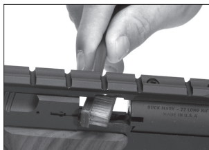
Clean with a nylon brush.

NOTICE! DO NOT PLACE LARGE QUANTITIES OF OIL INTO THE ACTION.